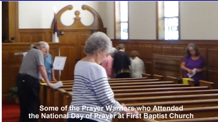
Some of the Prayer Warriors who Attended the National Day of Prayer at First Baptist Church