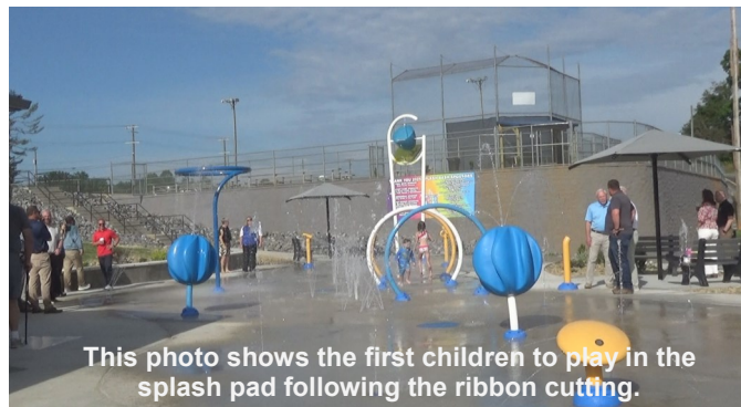
This photo shows the first children to play in the splash pad following the ribbon cutting.